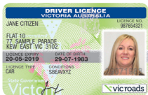
Australian driver licence