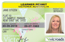
Victorian learner permit