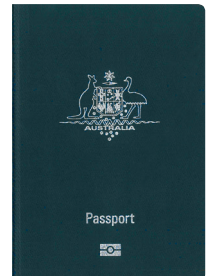
Australian or foreign passport