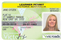
Victorian learner permit