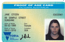
Proof of age card