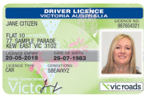
Australian driver licence