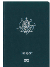
Australian or foreign passport