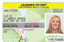
Victorian learner permit