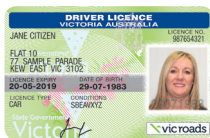
Australian driver licence