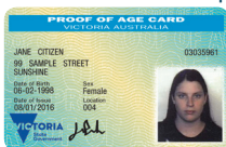
Proof of age card