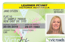
Victorian learner permit