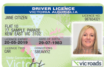
Australian driver licence