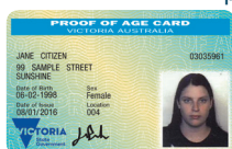
Proof of age card